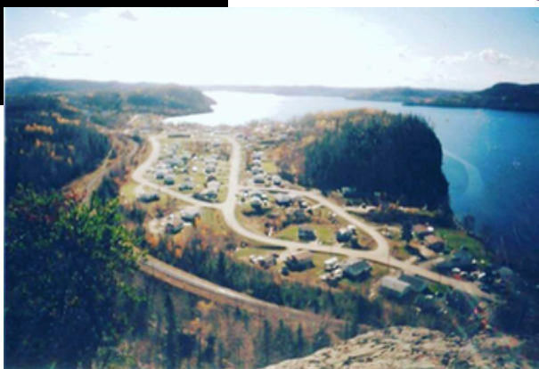
A view of Biinjitiwaabik Zaaging Anishinaabek.